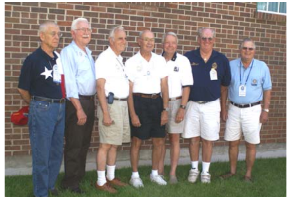
A Gathering of very elegant former Fellowship Presidents